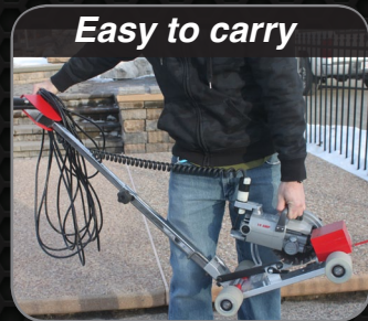
Easy to carry